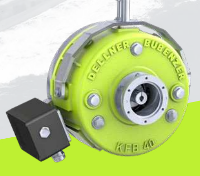
KFB 40 MOTOR MOUNTED BRAKES