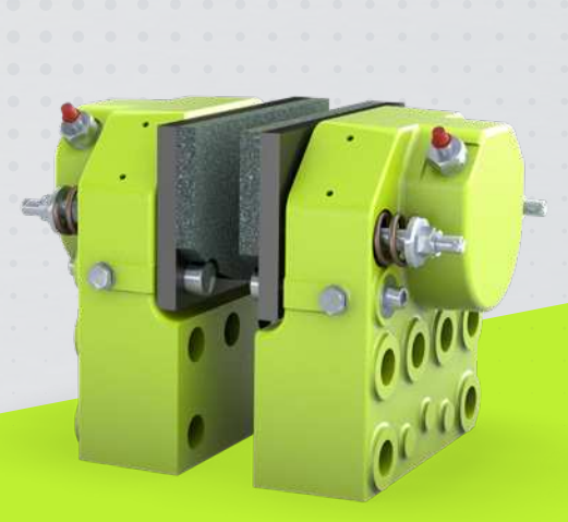
SKD 100 CALIPERS/DISC BRAKES