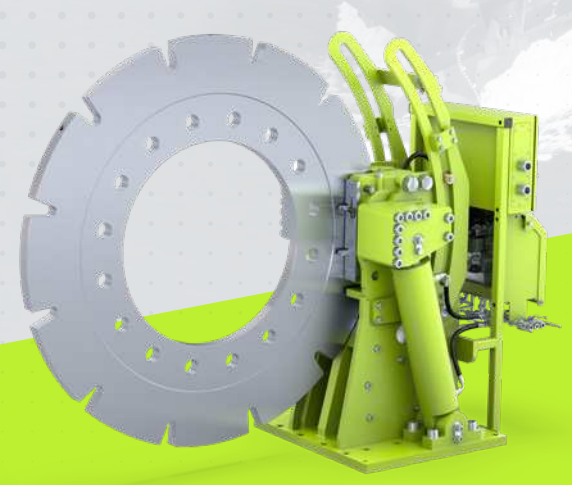
SITL STOP TURN LOCK SYSTEMS