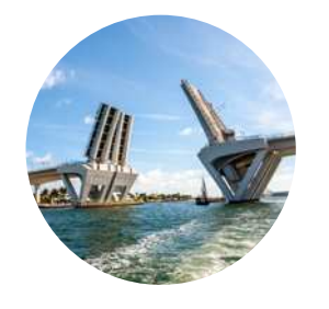
BRIDGES & MOVABLE STRUCTURES