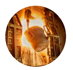
IRON & STEEL